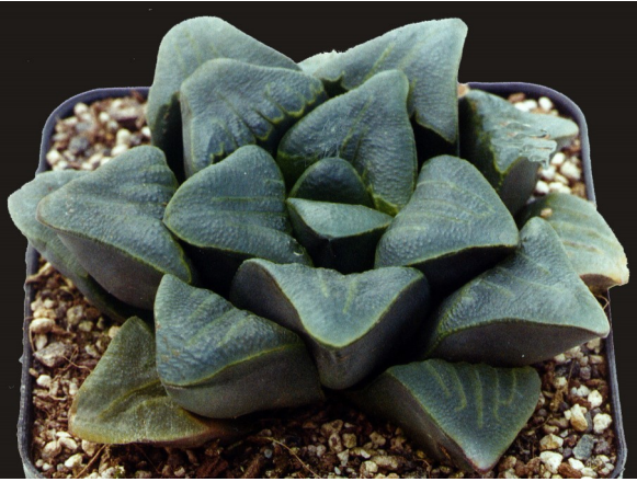
Fig. 9. Haworthia magnifica var. pseudomutica n.n. IB673 Korinte Vetdam, NW of Riversdale [3421AA]

more records before I make a final conclusion of its taxonomic status. You will recognise this taxon very easily by its long and very translucent end areas, which show only a few but clear, reddish veins. The shape is very acuminate and it is as thick as wide, which gives it a nearly conical appearance.