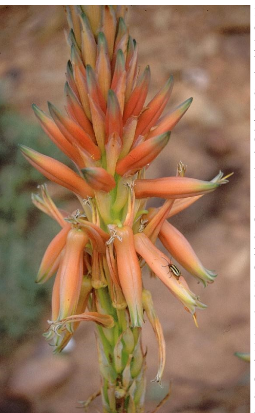
Fig. 26. Aloe glauca Arrangement of fruits, flowers and buds.

There is a small population of Aloe glauca with a few plants on both sides of the main road east of Calvinia in South Africa. Examination of a number of them revealed nothing particularly unusual. There were plants of different ages, mainly single heads. The leaves had fine longitudinal stripes, but were hardly blue-grey. They were green with only the slightest suggestion of blue and that required a little imagination. This colour can be associated with lower light intensity and good growth in a relatively prolonged rainy season, which the area had experienced. The leaves were long, broad at the base and narrowed at the middle to form a narrower upper half. The leaf edges bore strong, brown teeth. Plants were in flower. The racemes were produced between the upper leaves and had thick peduncles with prominent bracts. The racemes grow with buds vertically disposed. The buds open and die progressively from the bottom to the top. As a bud opens, it moves to the horizontal position, becoming pendent