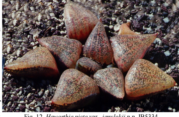
Fig. 12. Haworthia picta var. janvlokii n.n. IB5334 Near Kammanassie Dam, 10 km S of Dysseldorp [3322CB]

This taxon is well known cultivation as multifolia from Sandkraal. It is intermediate between wimii [= H. emelyae var. major (G.G.Sm.) M.B.Bayer] and multifolia with regard to the leaf features, but belongs clearly to multifolia