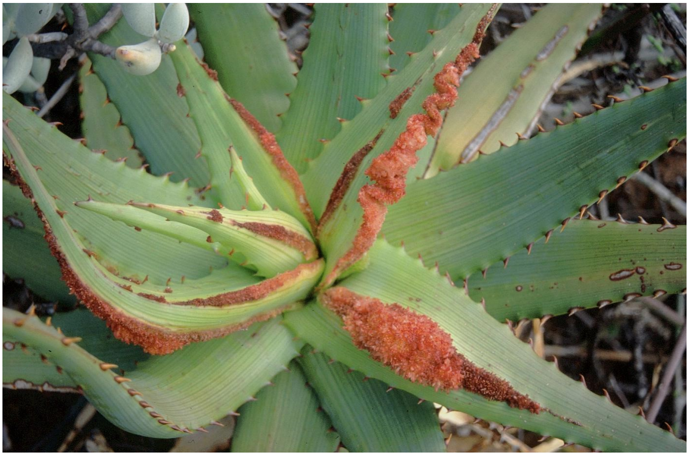
Fig. 27. Aloe glauca showing disposition of linear floral conglomerations on leaves adjacent to the normal point of emergence of the raceme. Note remains of a dead floral conglomeration from a previous year on the upper side of the leaf at top right. Fig. 28. Close up of an Aloe glauca floral conglomeration with die-back at the older tip and a few individual flowers just visible at the lower edge.