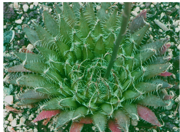
Fig. 15. Haworthia tradouwensis n.n. IB5510 Top of Tradouw Pass [3320DC]