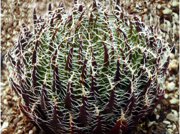
Fig. 16. Haworthia tretyrensis n.n. IB5372 Tretyre, 30 km SE of Steytlerville [3324BC]