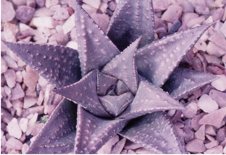
Fig. 21. Haworthia fasciata x Haworthia viscosa

The most common hybrids now in cultivation are produced within the subgenus Haworthia . Due to difficulty in setting seed, hybrids in the subgenus Hexangulares are still quite rare. This is an exceptionally special one involving Haworthia fasciata as the pollen acceptor. It is a painstakingly slow grower. A size of only 6 cm is achieved in nearly 4 years. Unfortunately only one plant survives. The leaves are very hard and the colour is dark brown to bronze. It looks like a living sculpture which has inherited desirable features from both parents: tough texture, dot-like tubercles on leaves, sharp leaf tips. However, its colour is unique. Whether it will grow columnar is still not known. It takes at least 2 to 4 years to evaluate its full morphological features. At this stage it is still stemless.