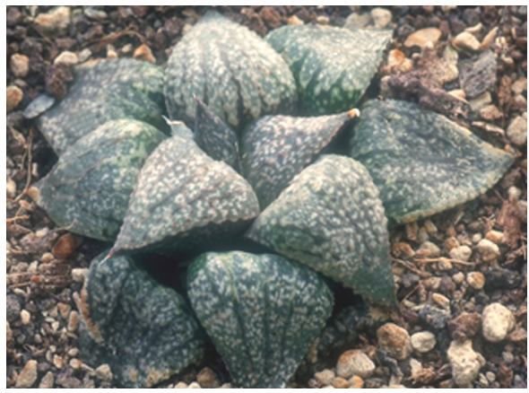
Fig. 13. Haworthia picta var. tricolour n.n. IB6775 Rooiberg Pass, SW of Calitzdorp [3321DA]

concerning floral characters. Sandkraal is east of the locality for H. wimii while Springfontein, the locality for H. multifolia , is west of the locality for wimii .