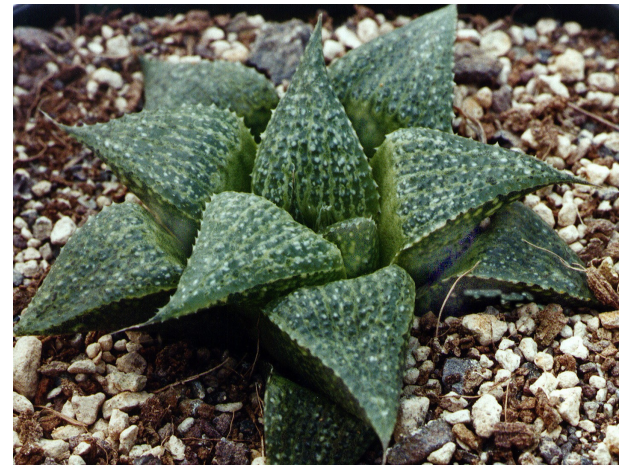
Fig. 1. Haworthia albertinensis n.n. IB4997= DP94-01 East of Albertinia [3421BA]