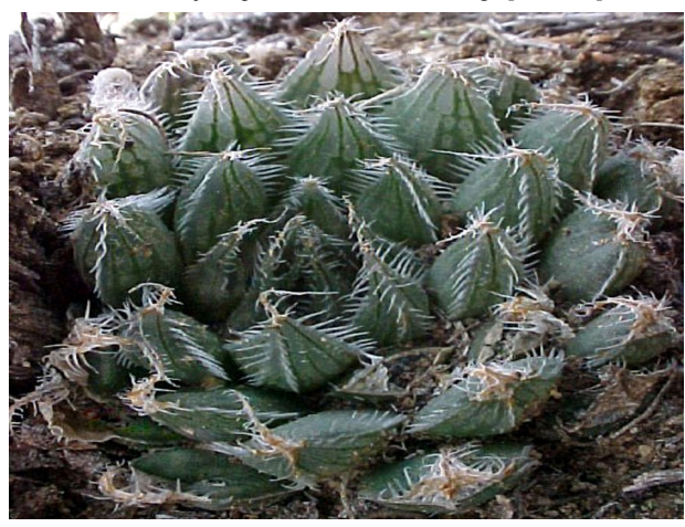
Fig. 3. Haworthia devriesii n.n. IB6930-2 = VDV643 North of Prince Albert [3322AA]