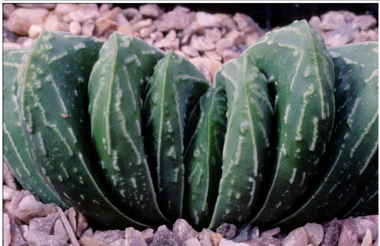
Fig. 22. Haworthia truncata hybrid Ham 303.