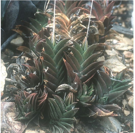
Fig. 18. Haworthia viscosa var. variabilis n.n. IB7193-2 Brandekraal, Joubertskraalrivier [3324CD]

characteristics it belongs more to picta , but as regards its leaf features it has the shape and size of comptoniana , but the coloration of picta . I will name it in honour of Jan Vlok, an explorer par excellence of South African flora, who was the first to find it.