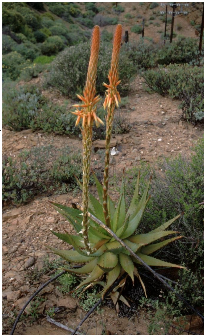
Fig. 25. Aloe glauca in habitat east of Calvinia

when open. The flowers are orange tinged pink. There was, therefore nothing to get excited about, one just admired the plants and expressed regret