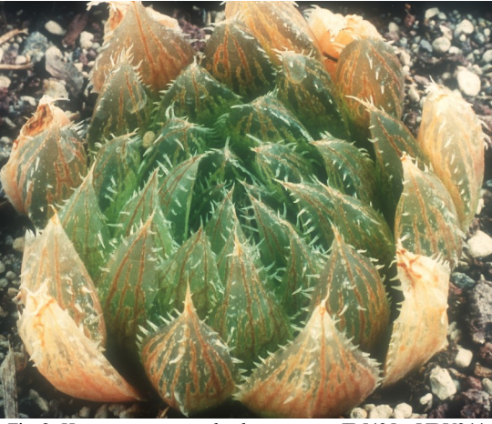
variety Fig. 8. H. mucronata var. calitzdorpensis n.n. IB5425 = VDV244 30 km SE of Calitzdorp [3321DC]

more records before I make a final conclusion of its taxonomic status. You will recognise this taxon very easily by its long and very translucent end areas, which show only a few but clear, reddish veins. The shape is very acuminate and it is as thick as wide, which gives it a nearly conical appearance.