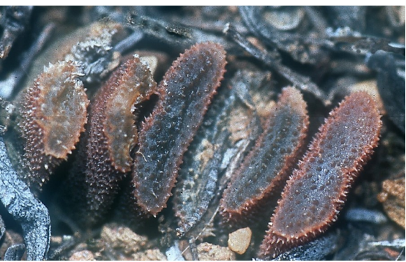
Fig. 17. Haworthia truncata var. minor n.n. IB6629 NE of Kammanassie Dam [3322CB]