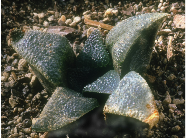
Fig. 2. Haworthia bayeri var. scabrifolia n.n. IB6383 = VDV445 East of Ezeljachtpoort, 30 km NE of George [3322DA]