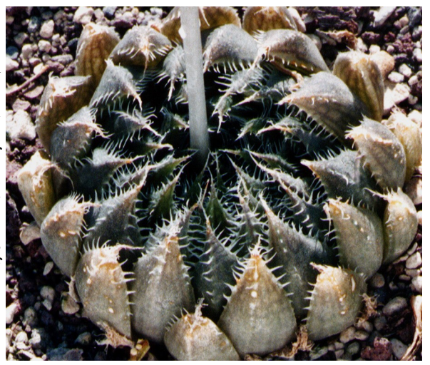
Fig. 14. Haworthia scottii n.n. IB5418 Gamka East, 10 km SE of Calitzdorp [3321DA]

This new taxon I have already introduced in Cactus & Co 2(4) 1998. It grows on several localities at Kammanassie Dam. As regards floral