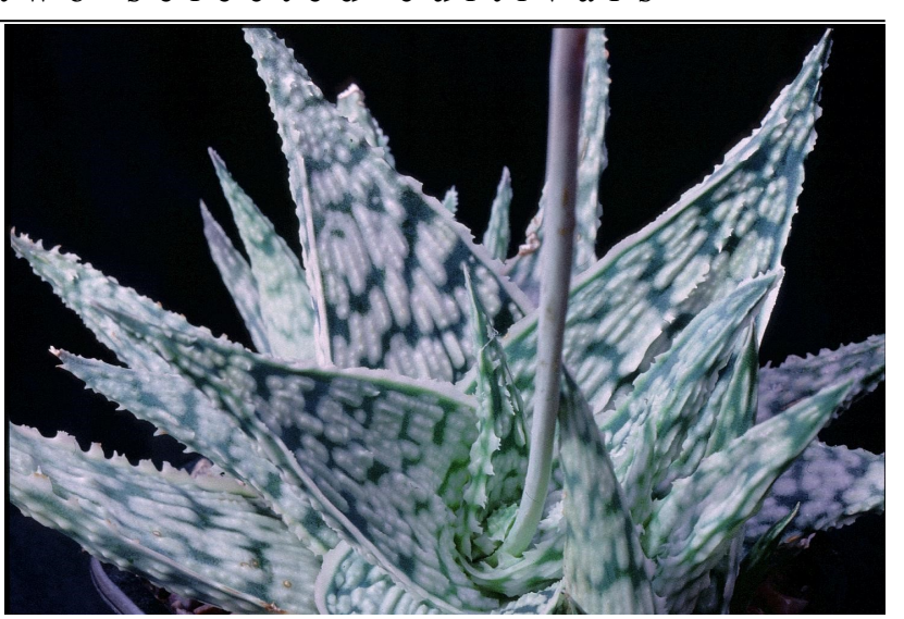
Fig. 23. Aloe 'Dorian Black'

Dwarf aloes, particularly hybrids, are always one of my favourites. They do not take up too much space. In others words, more plants can be housed in my glasshouse. Amongst the dwarf hybrids, 'Dorian Black' is an irresistible beauty, with lots of tubercles on the leaf surfaces, cartilaginous leaf margins, and broad and short leaves. Each rosette is about 12 cm across with leaves 7 cm long and 3 cm wide. Overall it looks like a miniature zebra plant sculpture. It is really a living artwork! Up to now I do not have any detailed information on the origin of this plant. I would be grateful to receive any information on the parents. Propagation is not a problem for this nice plant. Offsetting and leaf cutting are the easiest methods.