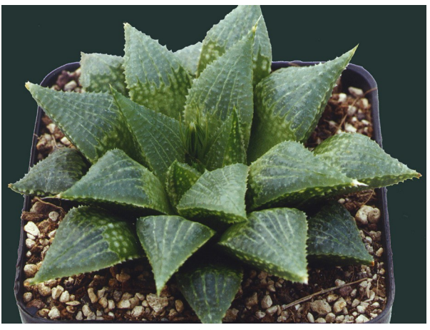
Fig. 10. Haworthia multifolia var. sandkraalensis IB640 Sandkraal, SW of Van Wyksdorp {3321CD]

This is a taxon, also known in cultivation for some time, introduced by Charles Craib with the name H. mutica . It grows North of Riversdale on rocky areas of a slope. Bayer treats it as H. magnifica var. atrofusca , which is situated more in the southern and southwestern parts of Riversdale. The plant rosette is larger in size as are the leaves. They are not so acuminate as atrofusca and the leaf tips are rounded, which might be the reason why Craib called it 'mutica'. Floral characters are the same as for magnifica , but the size and shape of the rosette and leaves are different from atrofusca .